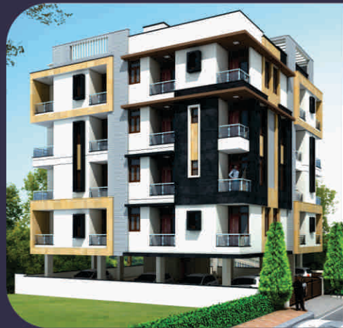
79-B Hari Marg Civil Lines Jaipur