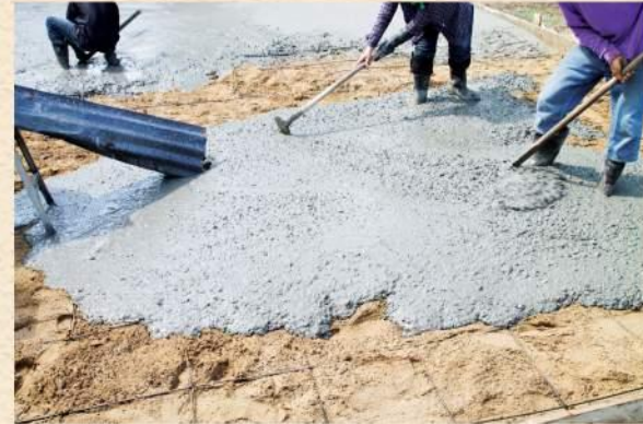
Premix mixes into the fluid concrete mixture which is then sprayed.

D.G.U. glasses are dustproof and allow natural light to pass through, giving you the feeling of being on vacation in the comfort of your own home.