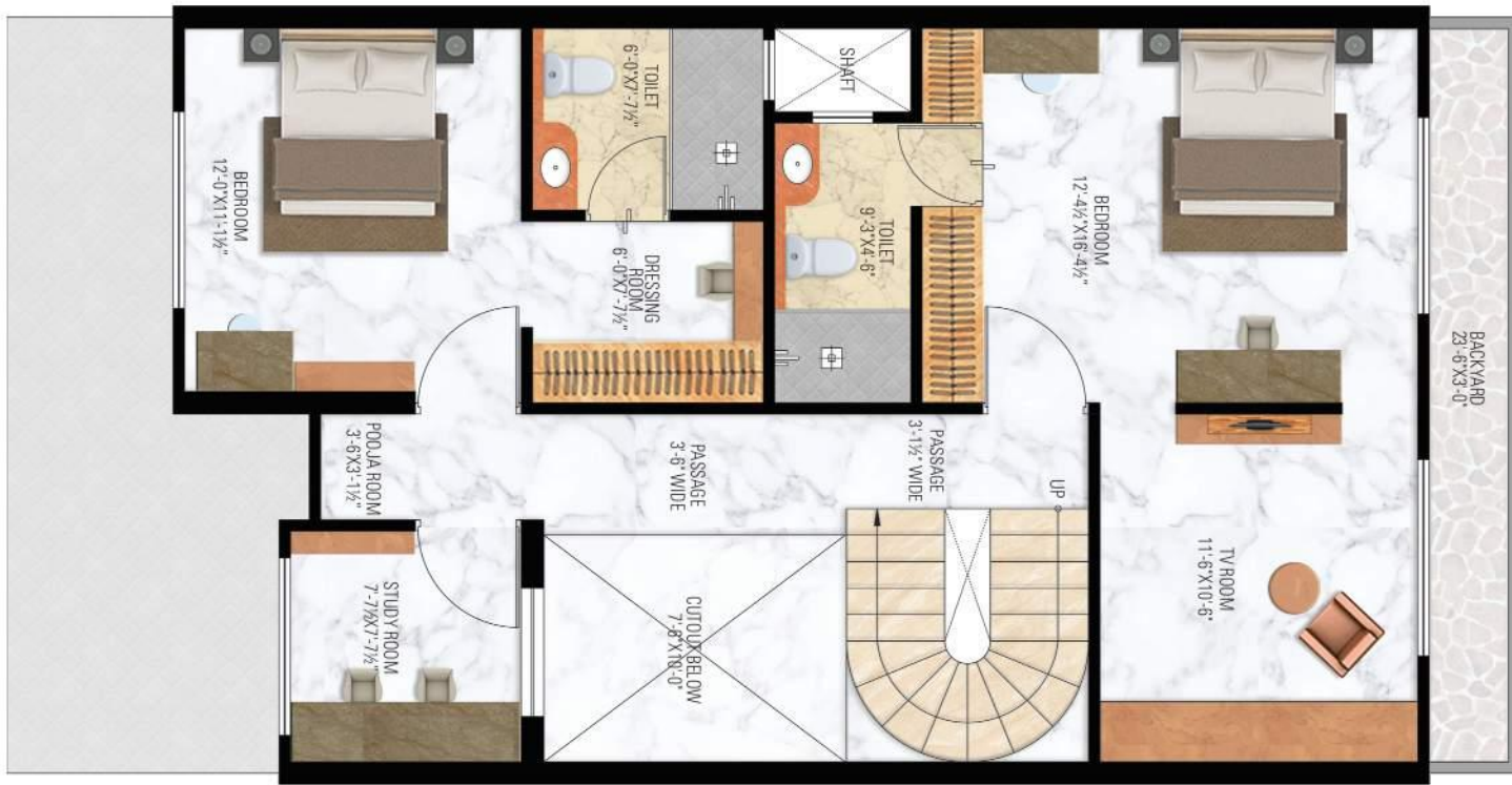
FIRST FLOOR LAYOUT PLAN