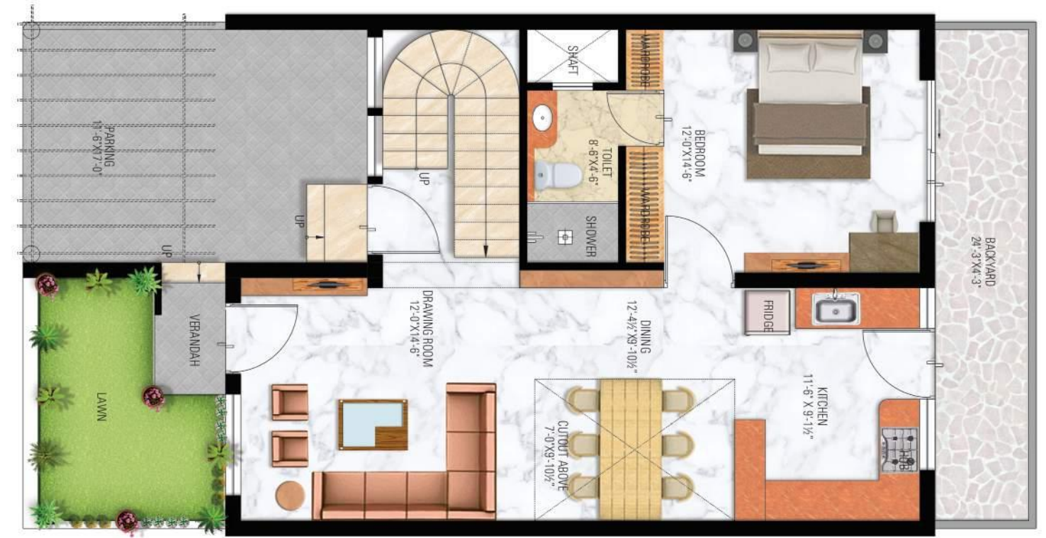
GROUND FLOOR LAYOUT PLAN