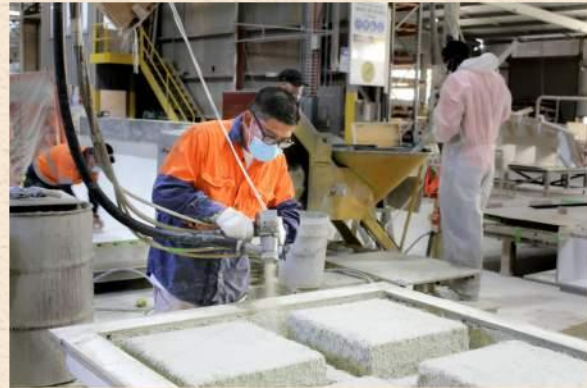
The application process for Spray-up GFRC is very similar to shotcrete in that the fluid concrete mixture is sprayed into the forms.

GRC is a composite of Portland cement, fine aggregate, water, acrylic co-polymer, glass fiber reinforcement and additives. The glass fibers reinforce the concrete, much as steel reinforcing does in conventional concrete. The glass fiber reinforcement results in a product with much higher flexural and tensile strengths than normal concrete, allowing its use in thin-wall casting applications. GFRC is a lightweight, durable material that can be cast into nearly unlimited shapes, colors and textures.