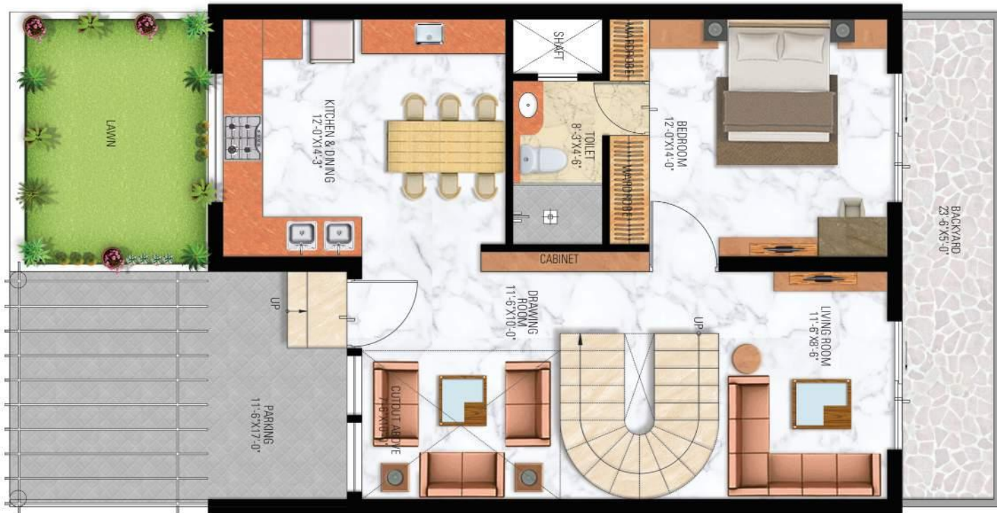
GROUND FLOOR LAYOUT PLAN