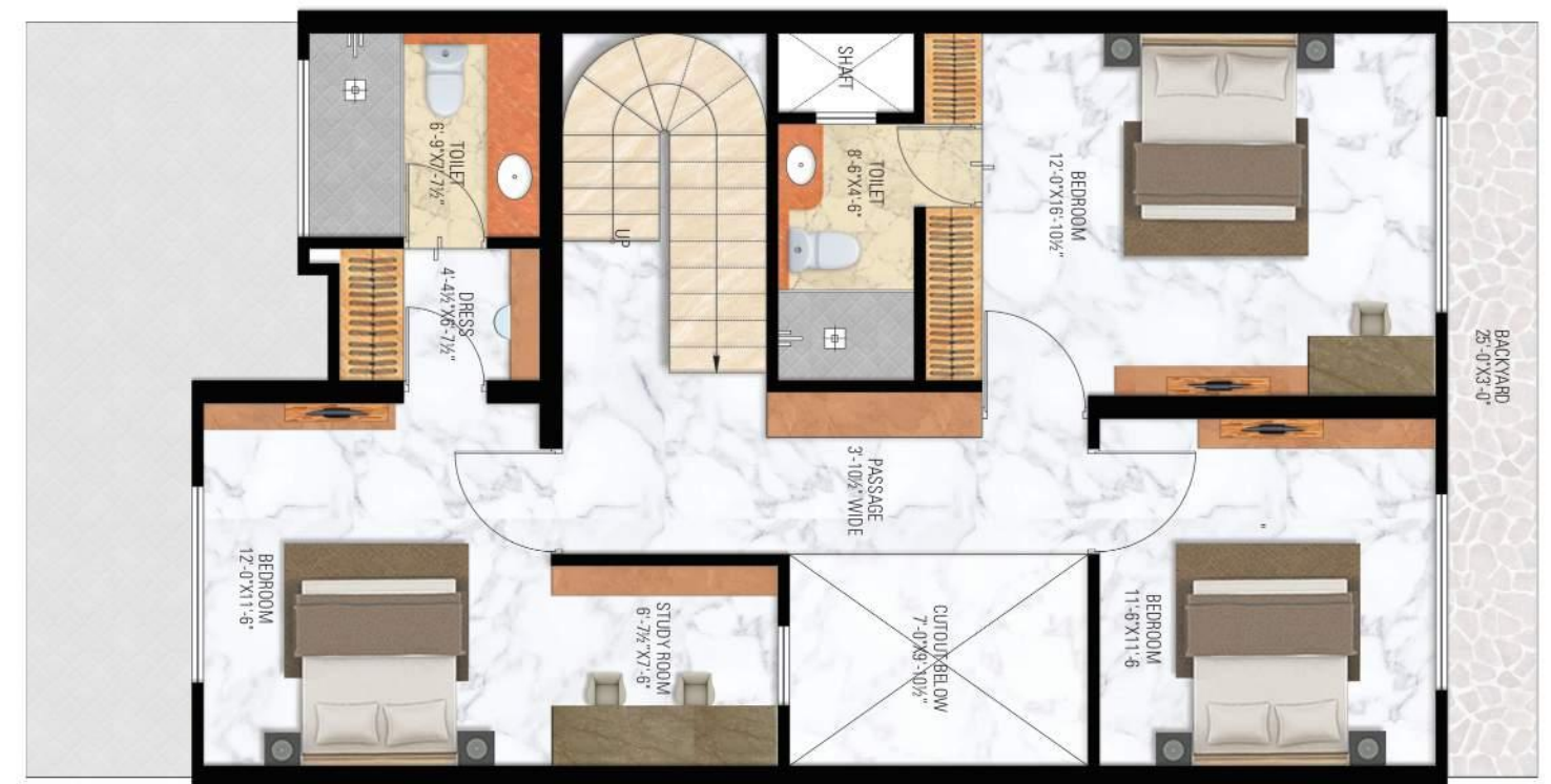
FIRST FLOOR LAYOUT PLAN